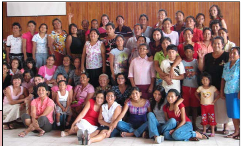
Women's conference in Iquitos