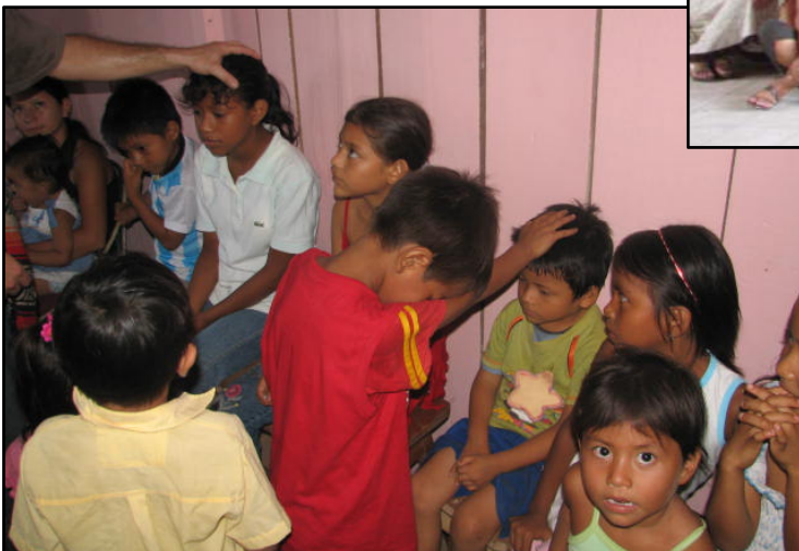
Some of the kids in the jungles praying for other kids at a children's service. It was awesome to watch them praying over each other!